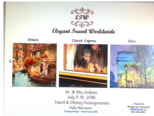
Sample Cover of a 35 page EFW Travel Package

With years of Venice Experience, it would be a pleasure to create your custom EFW Venice package with everything you need... to have one of the most fabulous vacations of your lifetime. It is my favorite destination because it is one of the only “left-untouched” cities on earth and with my guidance you will experience it as no ordinary traveler can or ever has... Call to discuss.