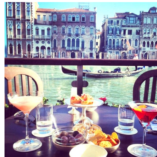
The Gritti Palace Cocktails on the Grand Canal