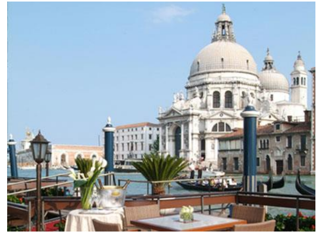
Gritti Palace Floating Deck

Daughter Brinley and I used to love to "cocktail" in the Gritti Bar (Marble...so grand) on cold winter nights in January when Venice was covered with glorious snow! But in mild weather you can be sitting on this floating deck taking in all the sights and sounds of Venezia!...before moving onto Dinner elsewhere.