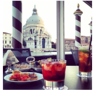
Gritti Palace Floating Deck

For many years this has been 1 of our favorite restaurants with superb food and service...run by an American female chef and her Venetian husband. Now under new management it still has yet another spectacular view. ..and some very nice Venetian dishes. It's Waterside Dining overlooking the Giudecca Canal...another spectacular water view. Makes a lovely evening!